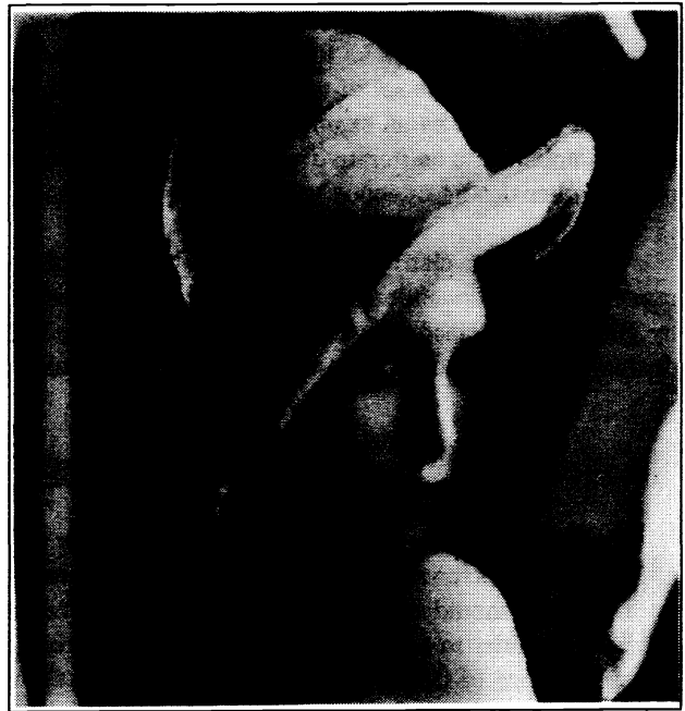
Figure 2b Edge-restored image of figure 2a by manually created directional filter masks. Strong artifacts are present in the form of speckle noise along the edges.