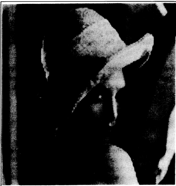
Figure 2a Degraded by BLT compression/decompression image of Lena.