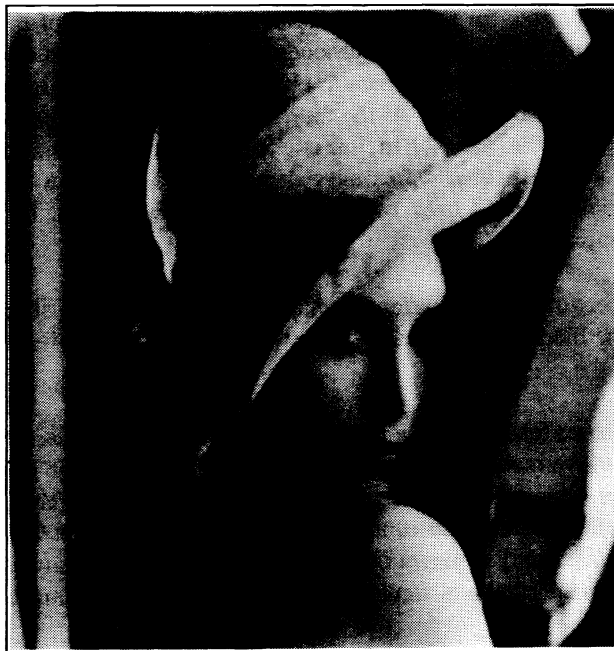
Figure 4 Lena image restored by directional NN.

Two examples have been given of this approach. In the first example, the network for edge detection with subpixel accuracy has been constructed based on the multi-layer feed-forward NN paradigm. The high-resolution edge location served as an output of a training pattern corresponding to an input of low-resolution image. Flexibility of the NN-AD enables easy adaptation to different image acquisition methods, image resolutions and formats. The second example has presented a network for edge restoration in degraded images (for example by BLT). The network consists of 16 directional subnetworks