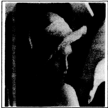
Figure 1a Low-resolution input image of Lena.